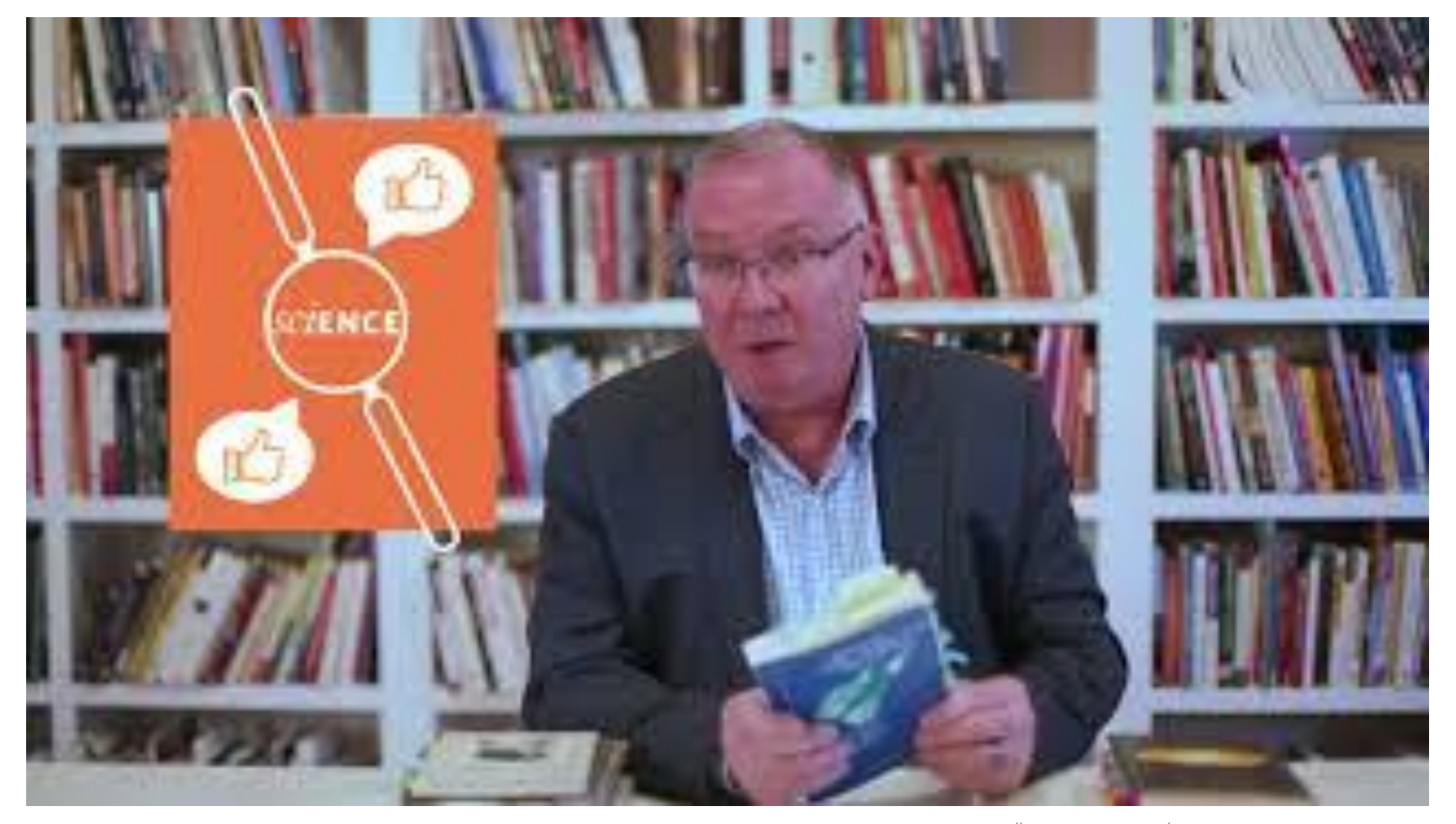
https://www.youtube.com/watch?v=BDRCrQuTAMg beginning at 3:50